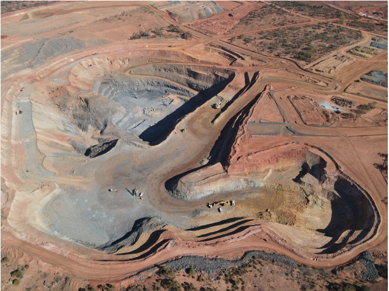
Missouri pit (looking north-west)