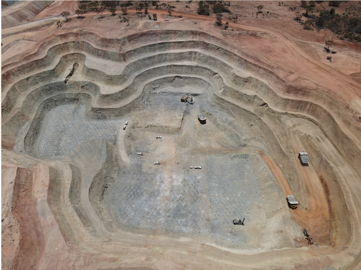
Riverina (looking north) showing minor slips in the walls.

Open pit mining activities at Riverina continued during the quarter. Productivity was below budget for the quarter, with workers redeployed to the Missouri mine whilst production was interrupted at Riverina due to delays associated with sample turnaround and geotechnical issues.